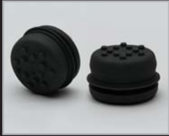
AWARE-FLOW® X2 JAW SHOCK ABSORBERS JAW (1") ITEM NUMBER: