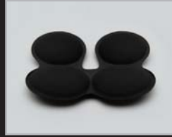
X2 COMFORT PADS - FRONT SIZE: EXTRA THICK ITEM NUMBER: THICKER COMFORT PADS PROVIDE MORE SIZING OPTIONS FOR A MORE SECURE FIT.