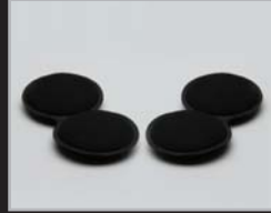
X2 COMFORT PADS - TEMPLE SIZE: EXTRA THICK ITEM NUMBER: THICKER COMFORT PADS PROVIDE MORE SIZING OPTIONS FOR A MORE SECURE FIT.