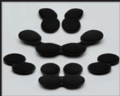
X2 COMFORT PAD SET SIZE: EXTRA THICK ITEM NUMBER: THICKER COMFORT PADS PROVIDE MORE SIZING OPTIONS FOR A MORE SECURE FIT.