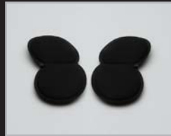
X2 COMFORT PADS - REAR SIZE: EXTRA THICK ITEM NUMBER: THICKER COMFORT PADS PROVIDE MORE SIZING OPTIONS FOR A MORE SECURE FIT.