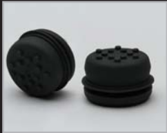
AWARE-FLOW® X2 JAW SHOCK ABSORBERS JAW (2") ITEM NUMBER: