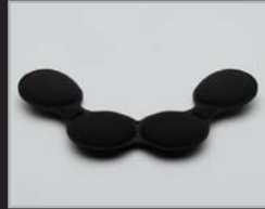
X2 COMFORT PADS - CROWN SIZE: EXTRA THICK ITEM NUMBER: THICKER COMFORT PADS PROVIDE MORE SIZING OPTIONS FOR A MORE SECURE FIT.